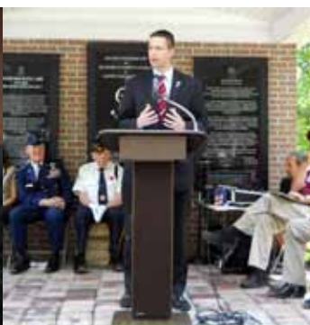
Memorial Day at Mt. Zion Historical Park, Weedville