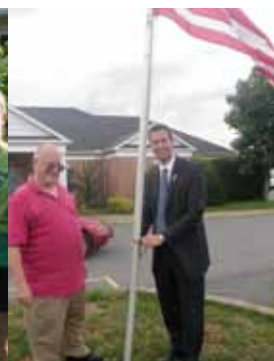
Presenting a flag to the DuBois Senior Center