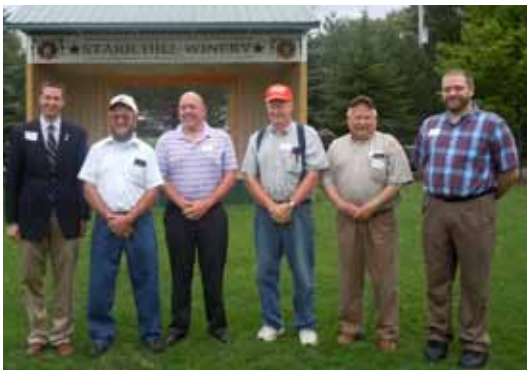
Meeting with the Clearfield County Farm Bureau