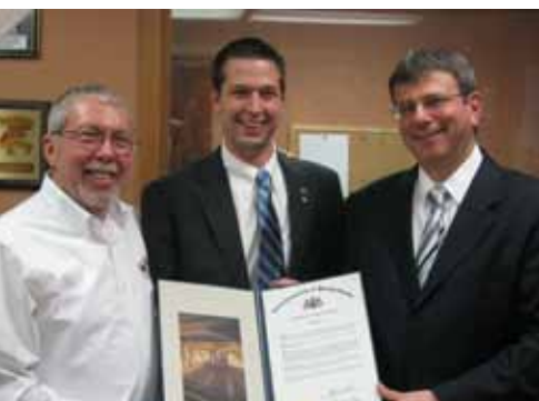
Celebrating WCED's 70th anniversary