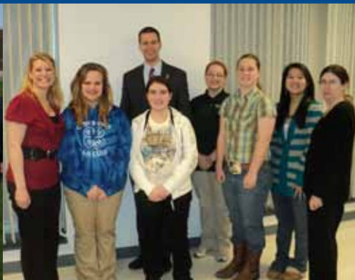
Youth Leadership Academy at Penn State-DuBois