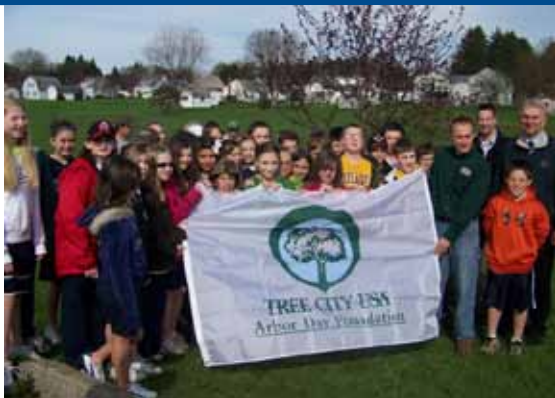
Arbor Day in St. Marys