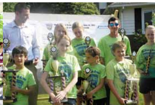
Soap Box Derby champions