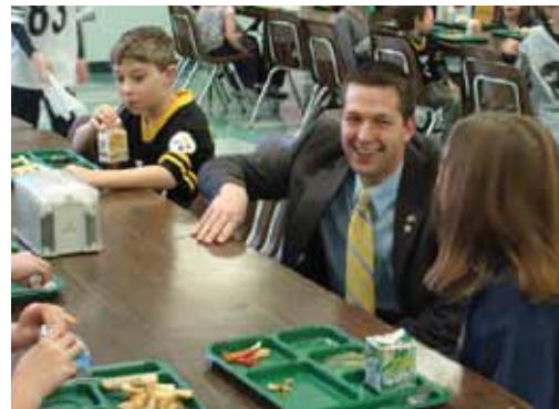
Catholic Schools Week at Elk County Catholic Elementary School